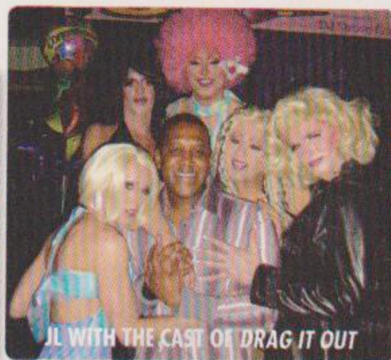
JL WITH THE CAST OF DRAG IT OUT